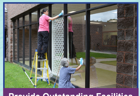
Provide Outstanding Facilities