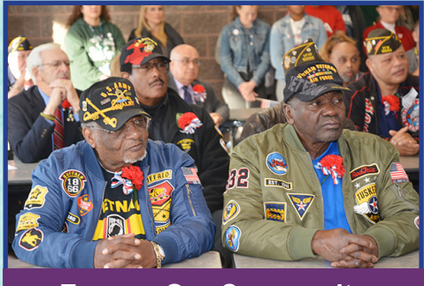
Engage Our Community