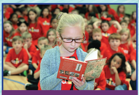
Deliver Exceptional Instruction